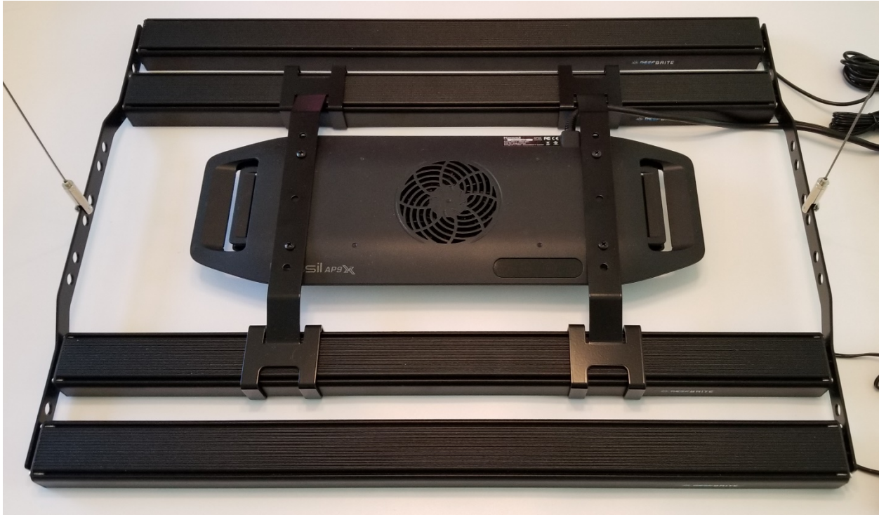
Figure 10 Completed X Series Dual installed on AP9X

The completed setup should look like this.