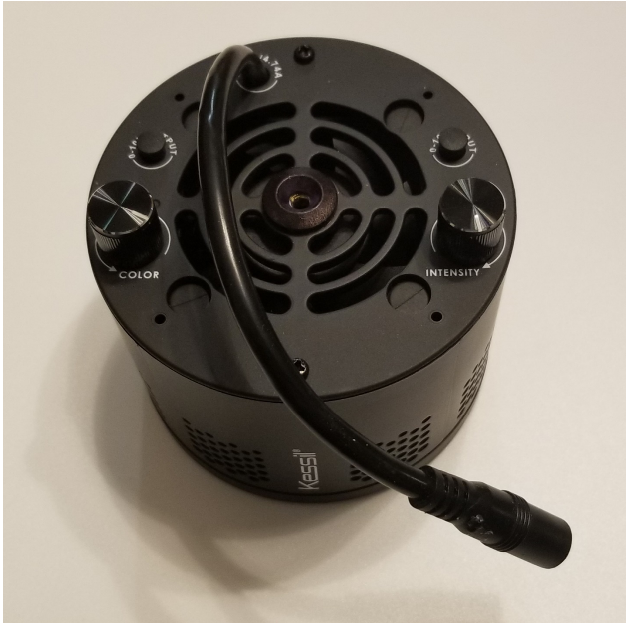
Figure 5 Nylon Spacer placement