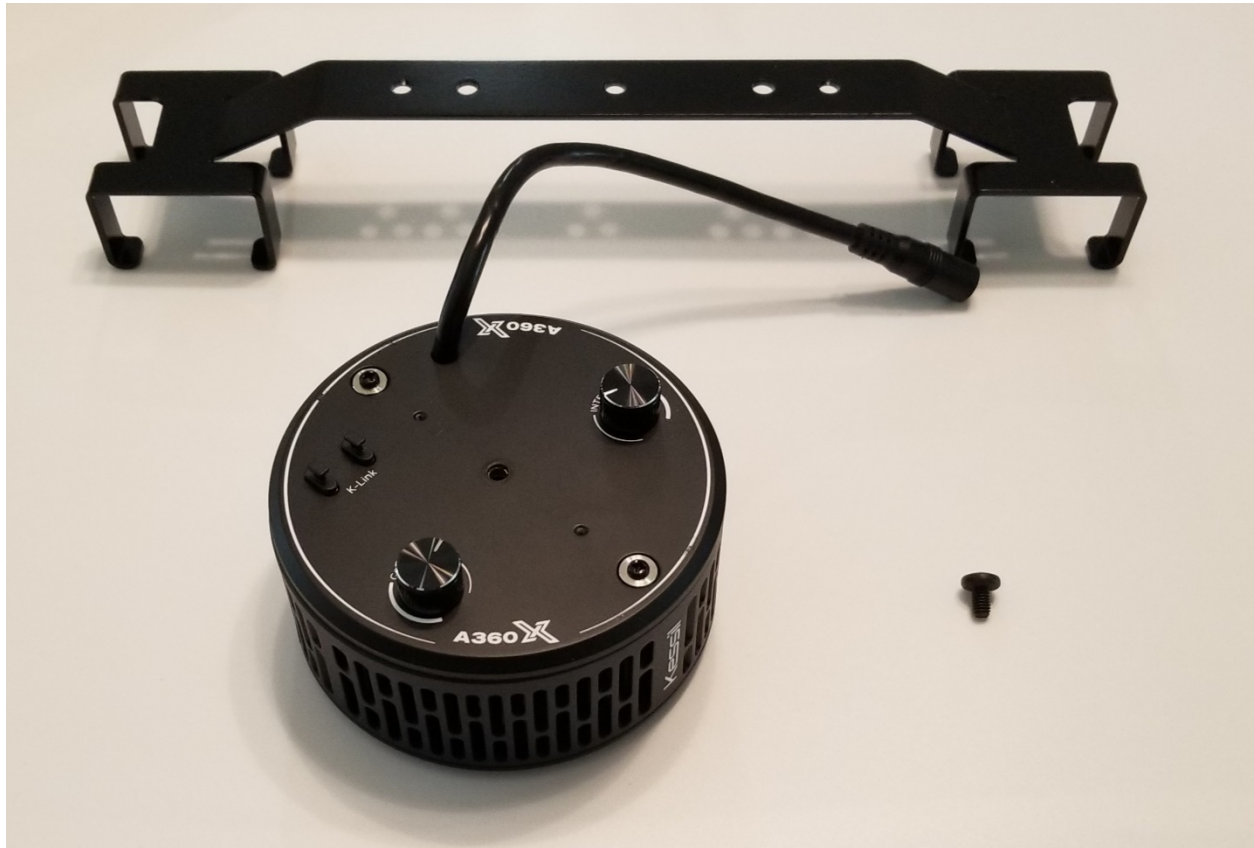
Figure 2 Light Bracket with M5 x 8mm screw

Kessil 360x: Locate the threaded hole on the top center of the 360x. Using one of the included Black M5 x .8mm thread x 8mm long pan head screws provided, mount the bracket to the 360x. See picture below. It is highly recommended to carefully thread the screw by hand to ensure that the screw is not cross threaded and avoid over tightening. DO NOT use the M5 x .8mm thread x 12mm long screws for the 360x as damage to the 360x can occur.