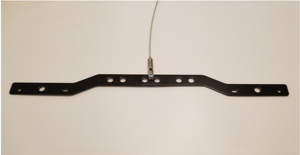
Figure 9 Hanger attachment installed on end plate

Install the hanger attachment to the endplates by loosening the screw on the hanger attachment and sliding it over the hole located at the top center of each end plate.