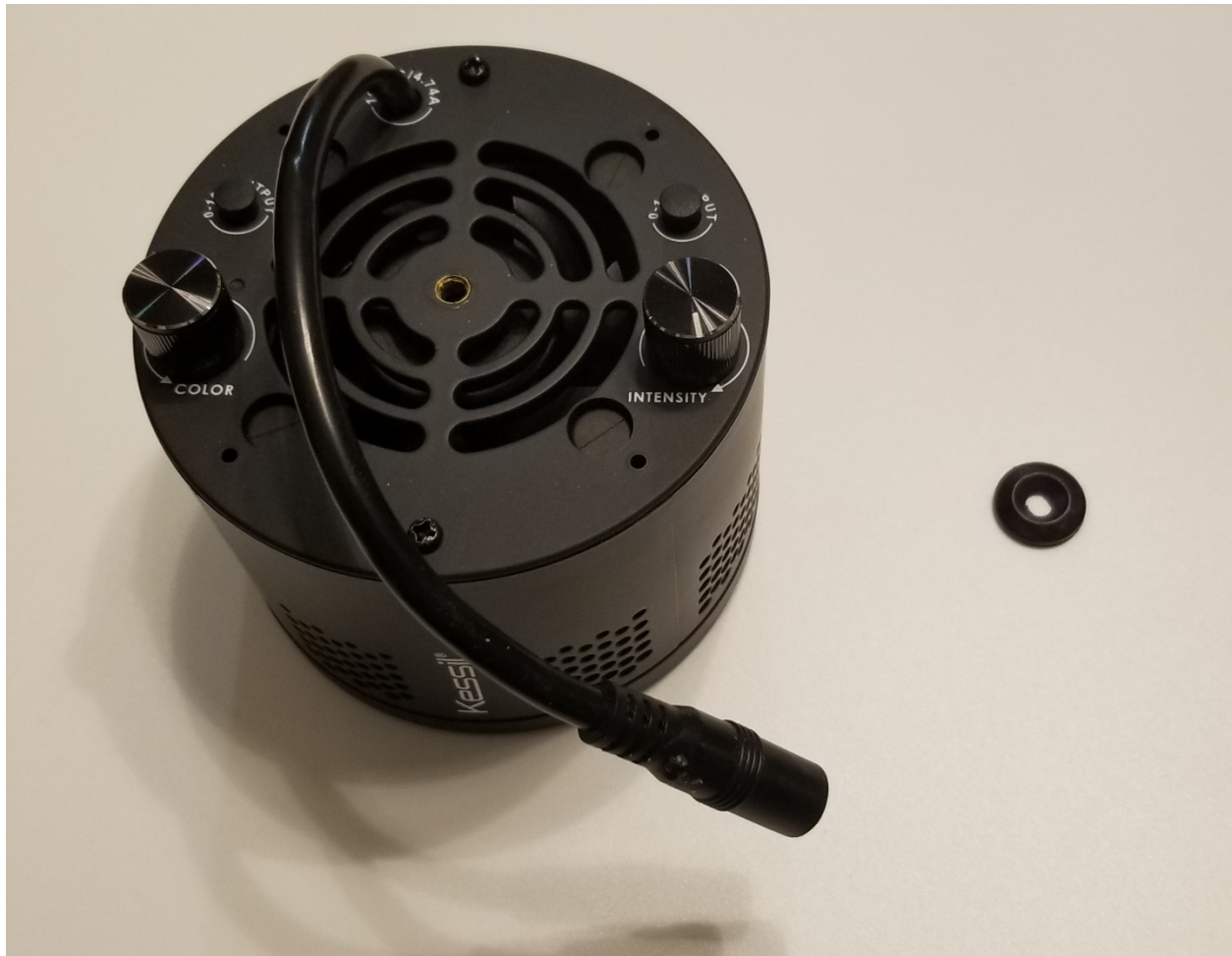
Figure 4 Nylon Spacer

The Black Nylon spacers can be found attached to the M5 x 25mm flat head screws used for the AI Hydra units.