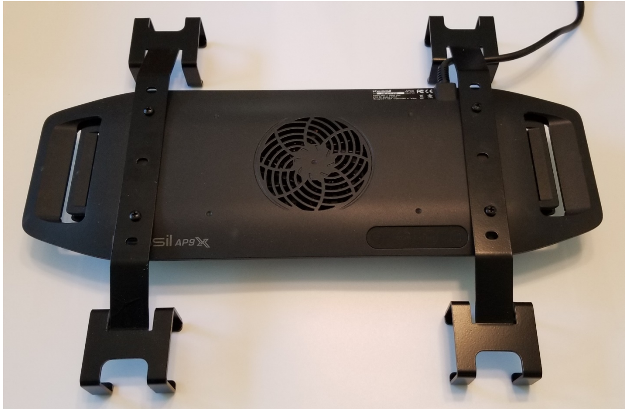
Figure 7 Light Brackets installed on AP9X

Kessil AP9X and AP700 units: Locate the four threaded holes on the top of your AP9X. Using the four Black M4 x .7mm thread x 12mm long screws mount two of the included light brackets to the AP9X. It is highly recommended to carefully thread the screws by hand to ensure that the screws are not cross threaded and avoid over tightening.