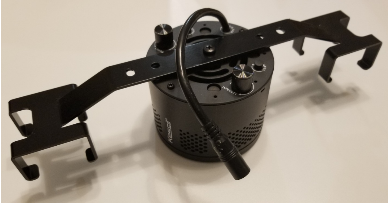
Figure 6 Light Bracket installed using Nylon spacer