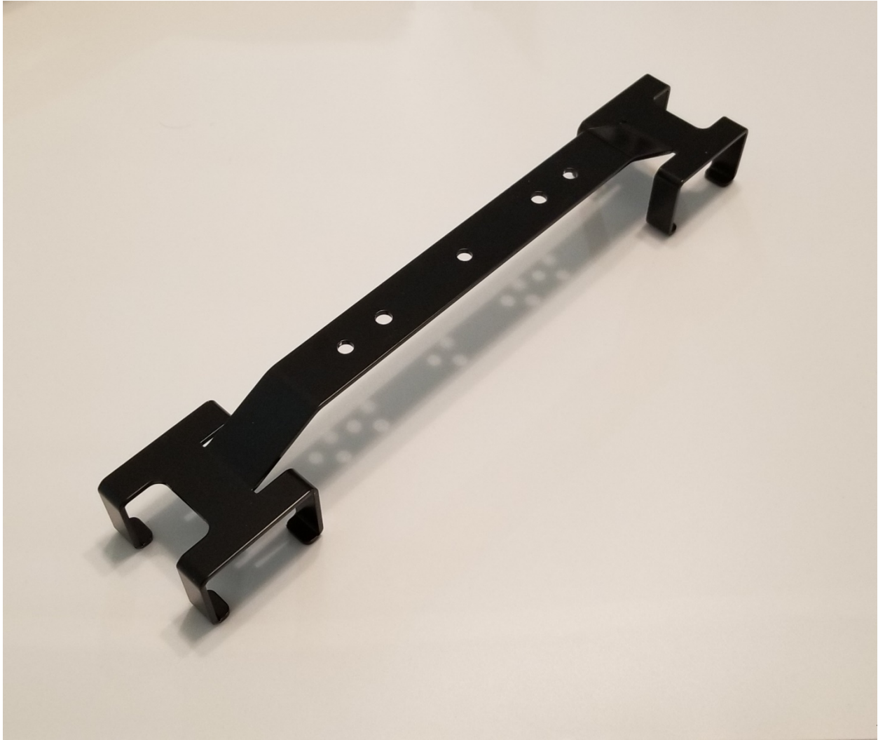
Figure 1 Light Bracket

Installation instructions: Install the included light brackets (Figure 1) according to the directions listed below for your specific fixture using the included hardware. For Kessil 360 series use one light bracket per 360. For Radion, Hydra, AP9X and AP700 use two light brackets per fixture.