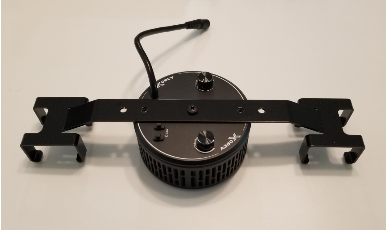
Figure 3 Light Bracket installed